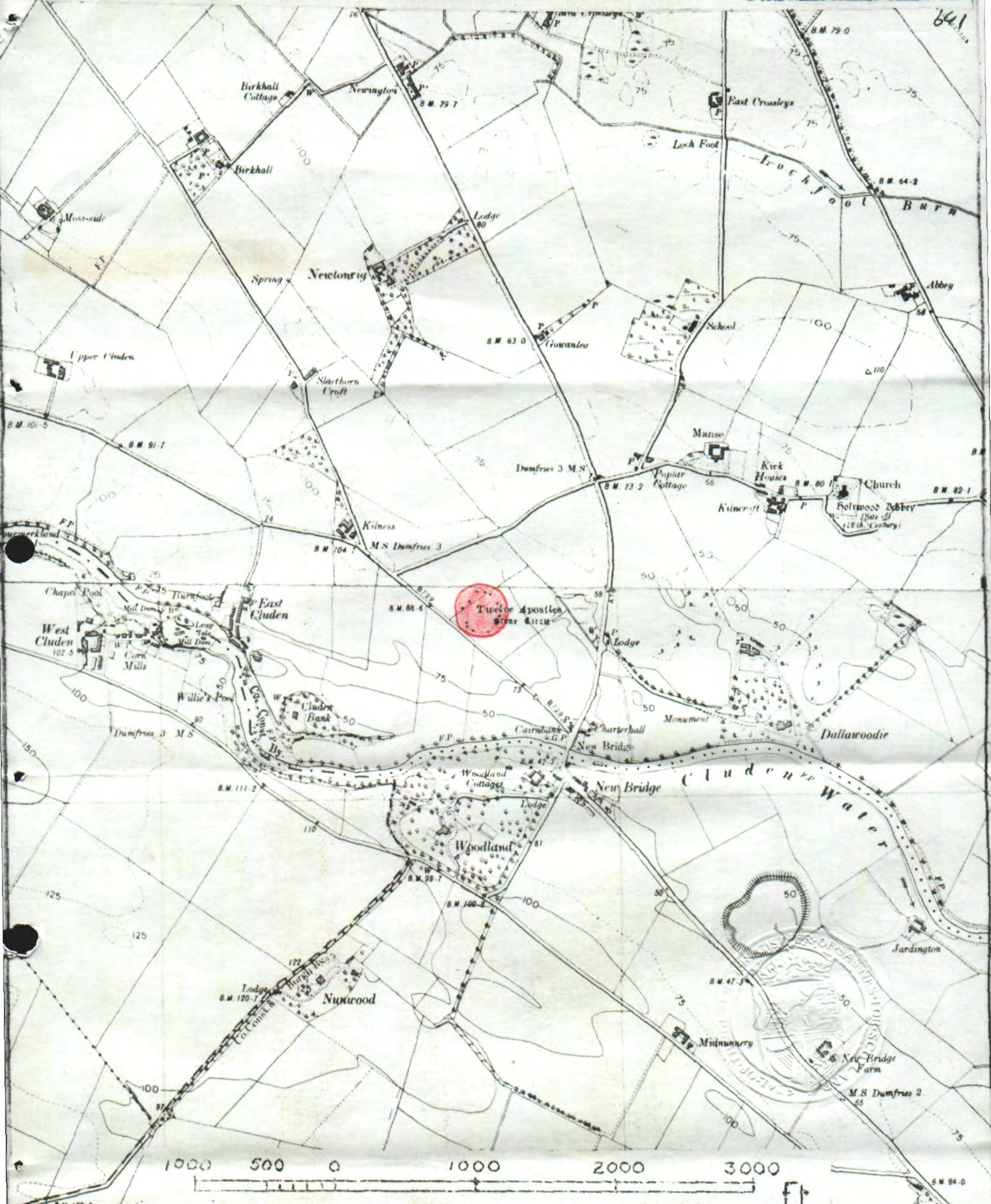
TWELVE APOSTLES "(STONE CIRCLE)" KIINESS