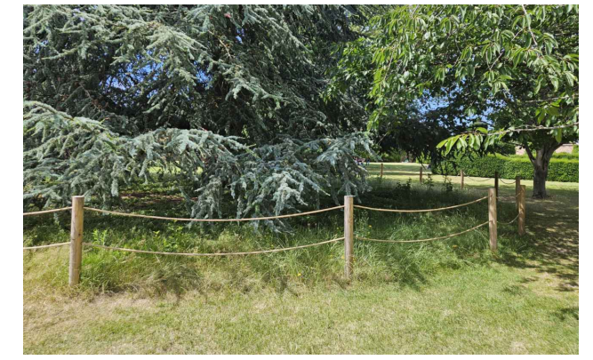
Proposed Fence Type