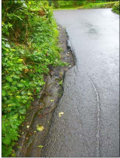
VIEW 2: View of road tarmac edge and verge at boundary hedge, damaged by HGV traffic.