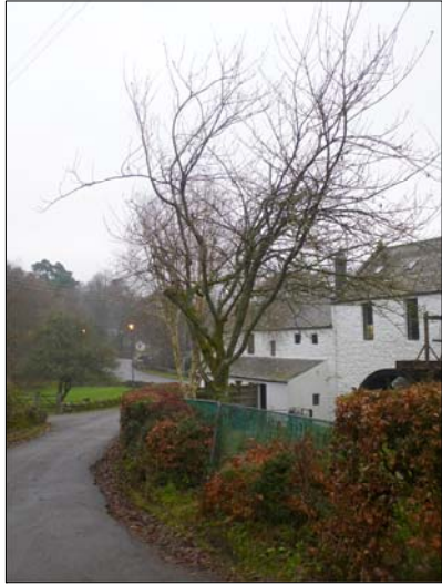
VIEW 3: View of damage to existing Cherry tree and boundary hedge, due to HGV traffic incursion.