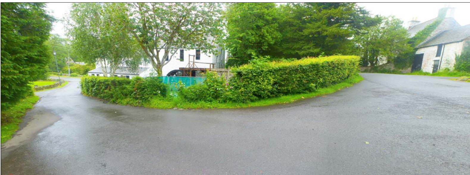
VIEW 4: Boundary hedge viewed from south-west. *Note section damaged by HGV traffic incursion with temporary Herras fence panels within garden.

REV A: 19/12/2016 [SD] - Notes amended & scale bar added for planning.