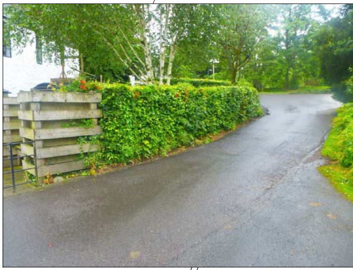
VIEW 1: Boundary hedge viewed from north.