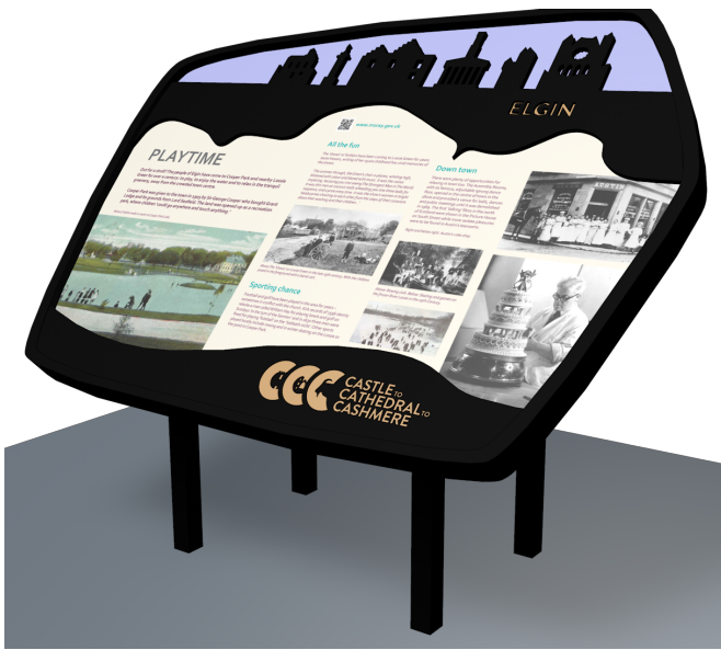
Level 1 landscape perspective