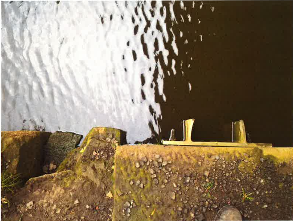
Vertical Steel Plank grooves to be removed & Perished masonry replaced