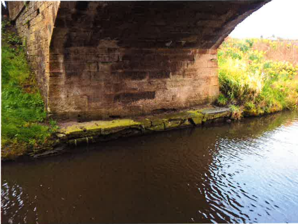
General view on offside of bridge and original safety gate location