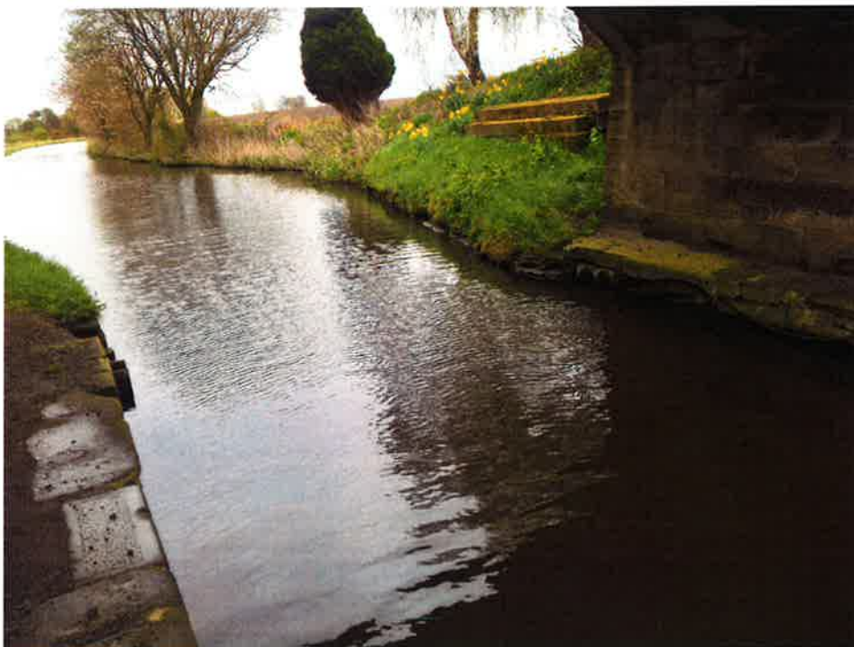
General view on bridge hole canal channel