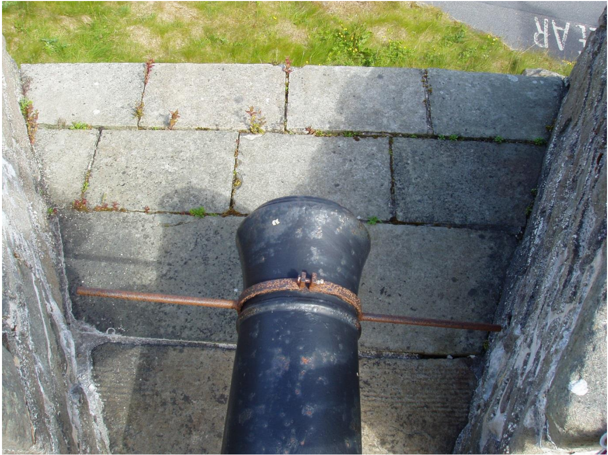
Rake out and repoint embrasure paving to remove weeds traps