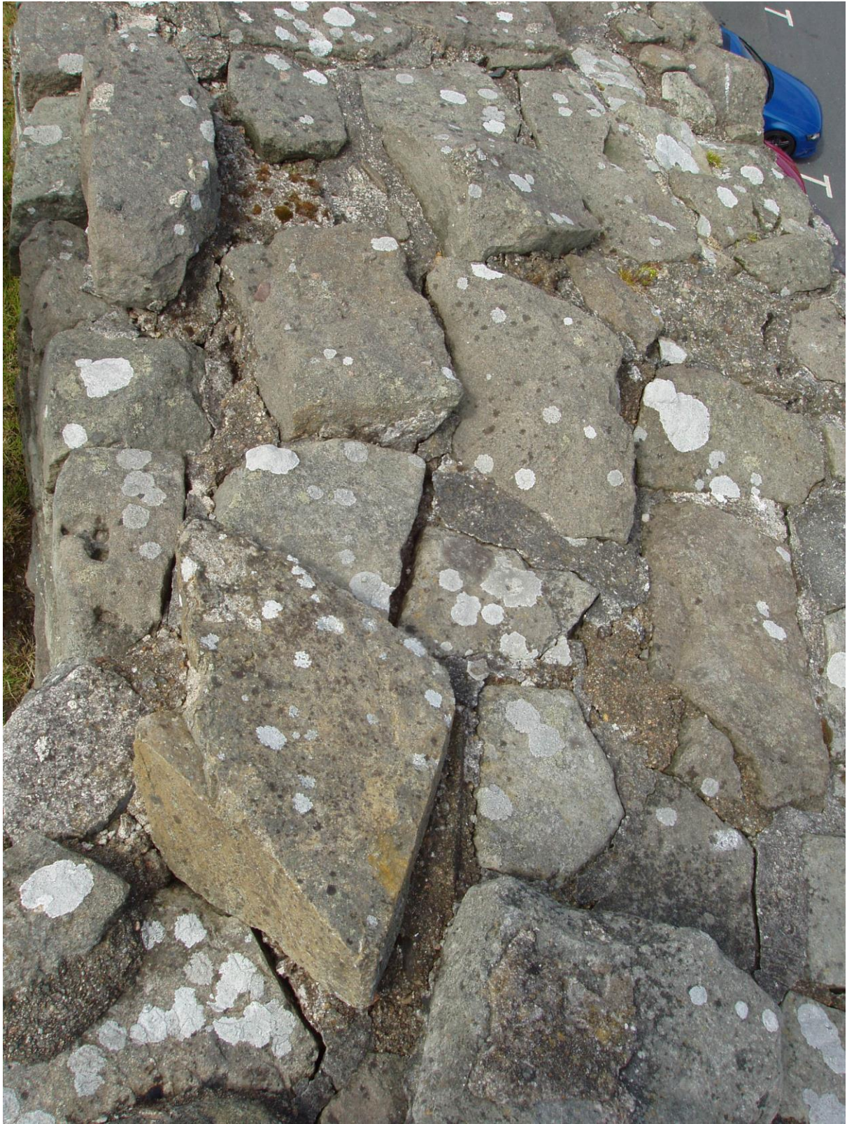
Old settlement cracks to be raked out, tamped and grouted if practicable.