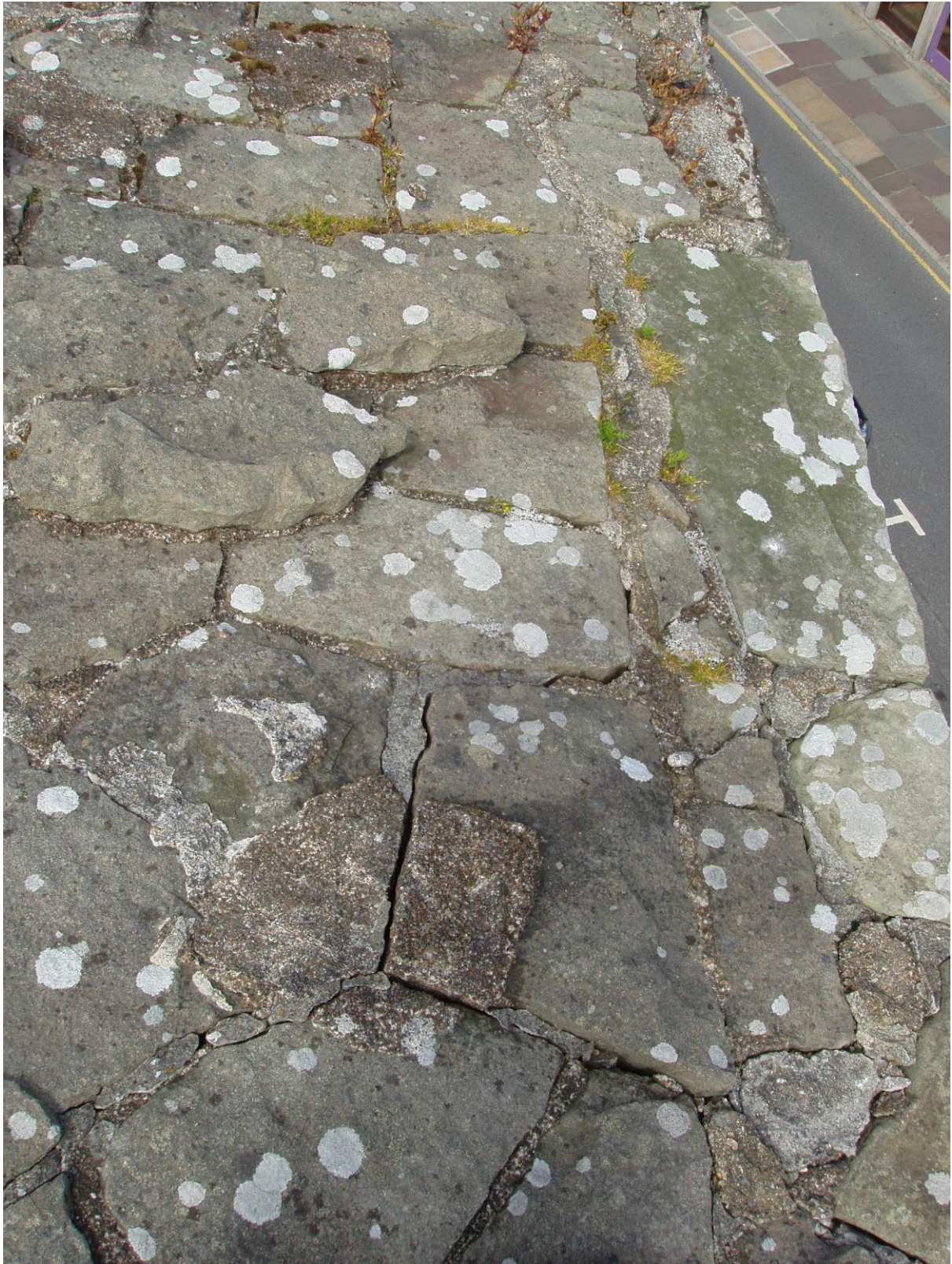
Old settlement cracks to be raked out tamped and grouted, broken mortar to be removed and renewed