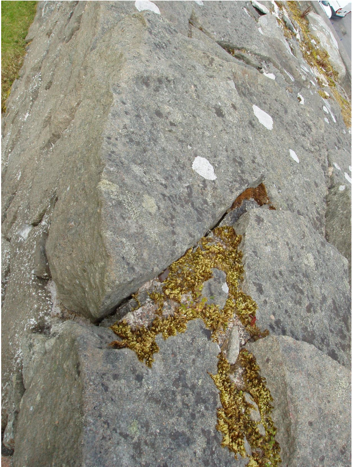
Rake out old settlement cracks, tamp and grout