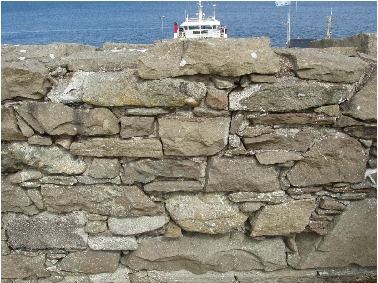
Old settlement cracks to be raked out, tamped and grouted if practicable