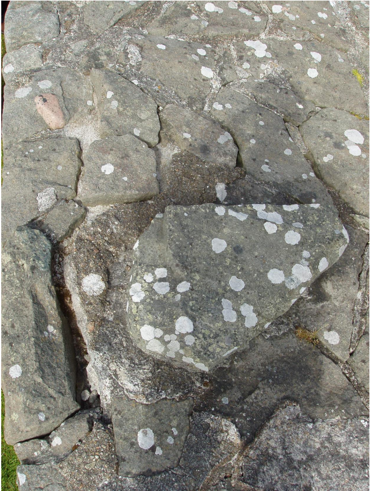
Loose stones to be rebedded.