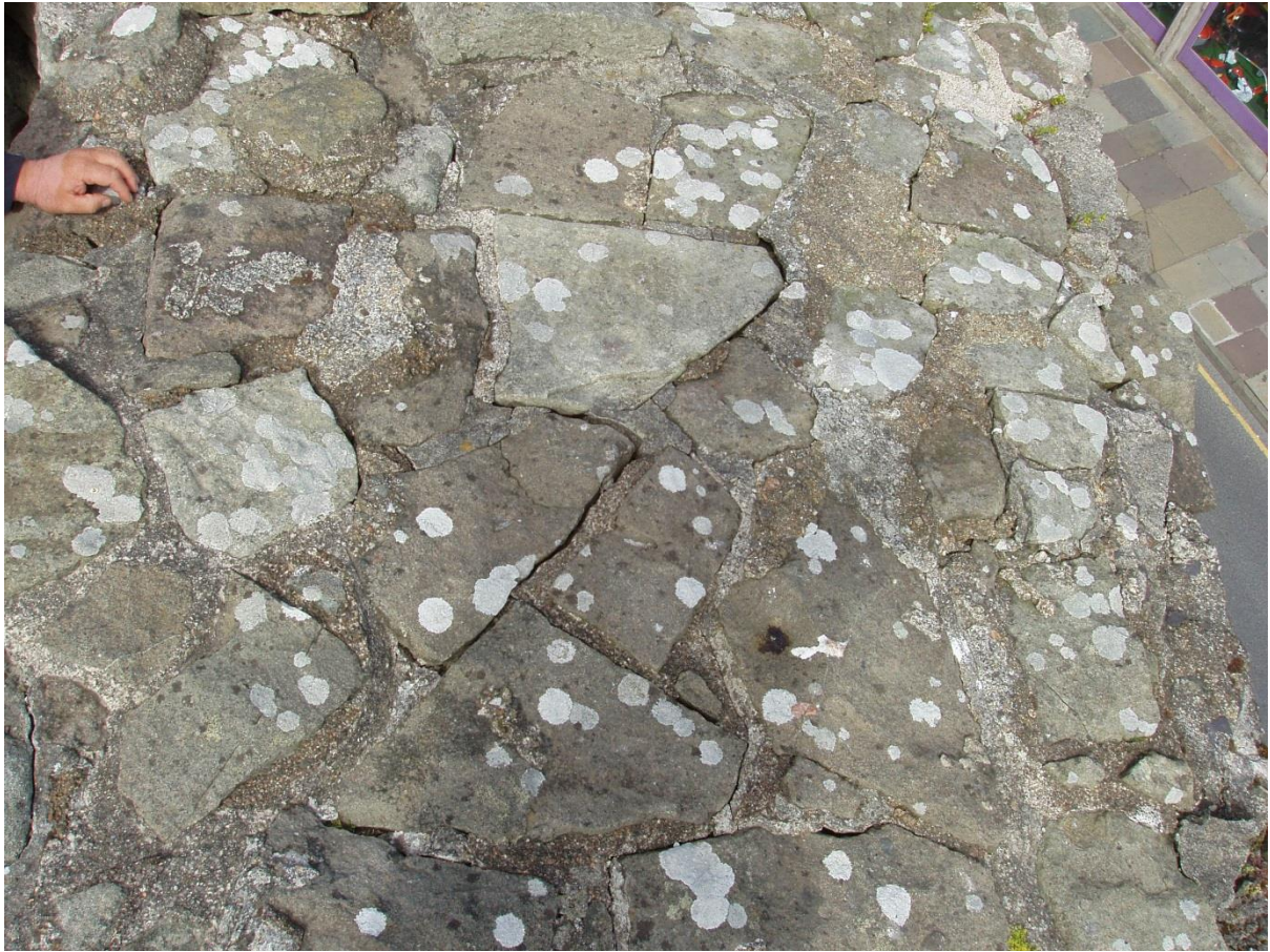
Old settlement cracks to be raked out, tamped and grouted.