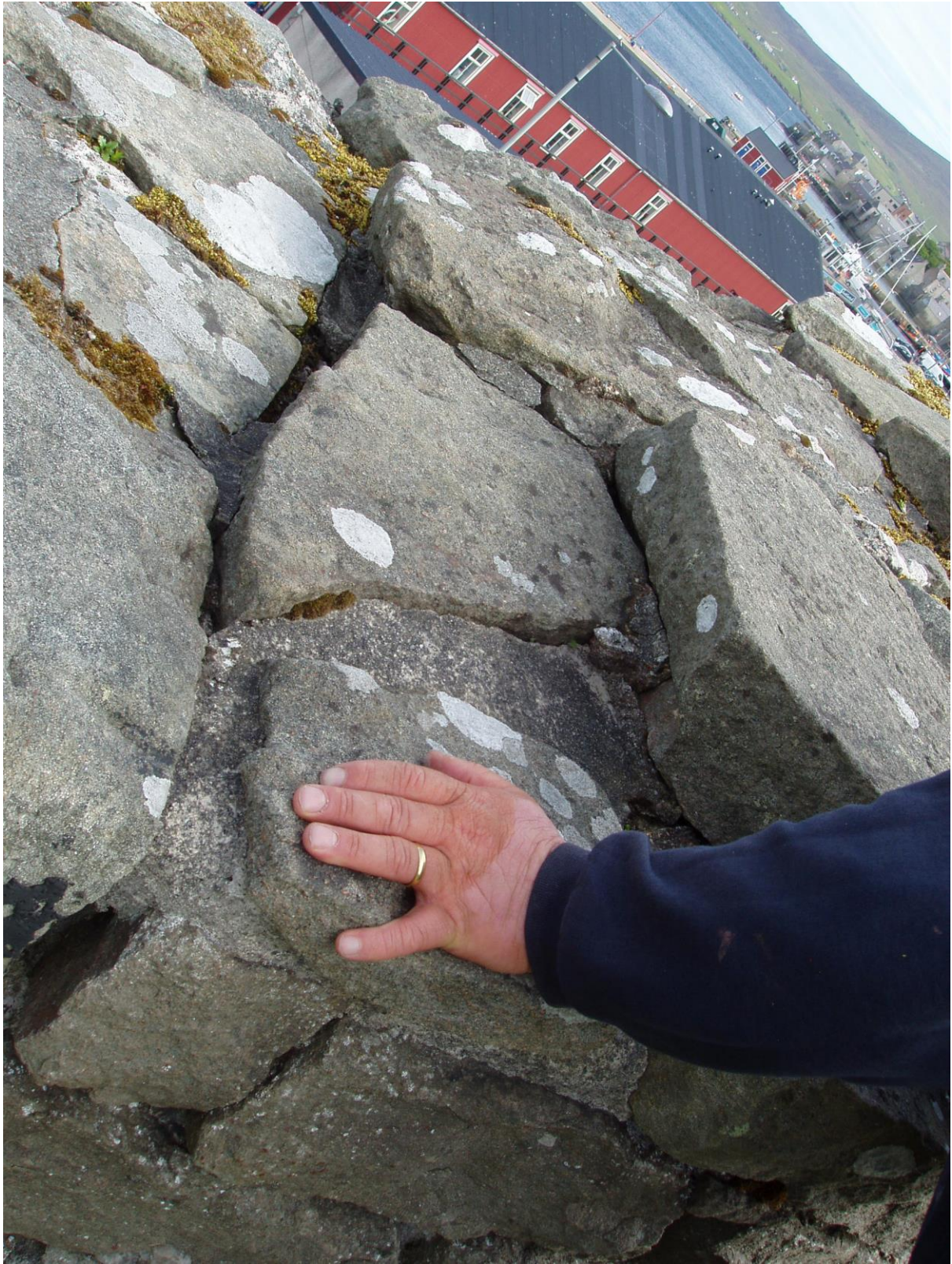
Rake out old settlement cracks, tamp and grout.