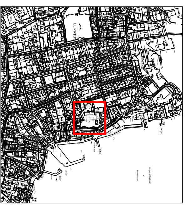
LOCATION PLAN 1:10000

This map is reproduced from Ordnance Survey material with the permission of Ordnance Survey on behalf of the Controller of Her Majesty's Stationery Office @ Crown Copyright. Unauthorised reproduction infringes Crown Copyright and may lead to prosecution or civil proceedings. Historic Scotland Licence No. 100017606 (2016).