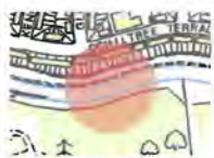
Representation of the Scheduled Area

Index No: 11200 Carstairs Mains, Roman temporary camp 750m SE of Carstairs Parish