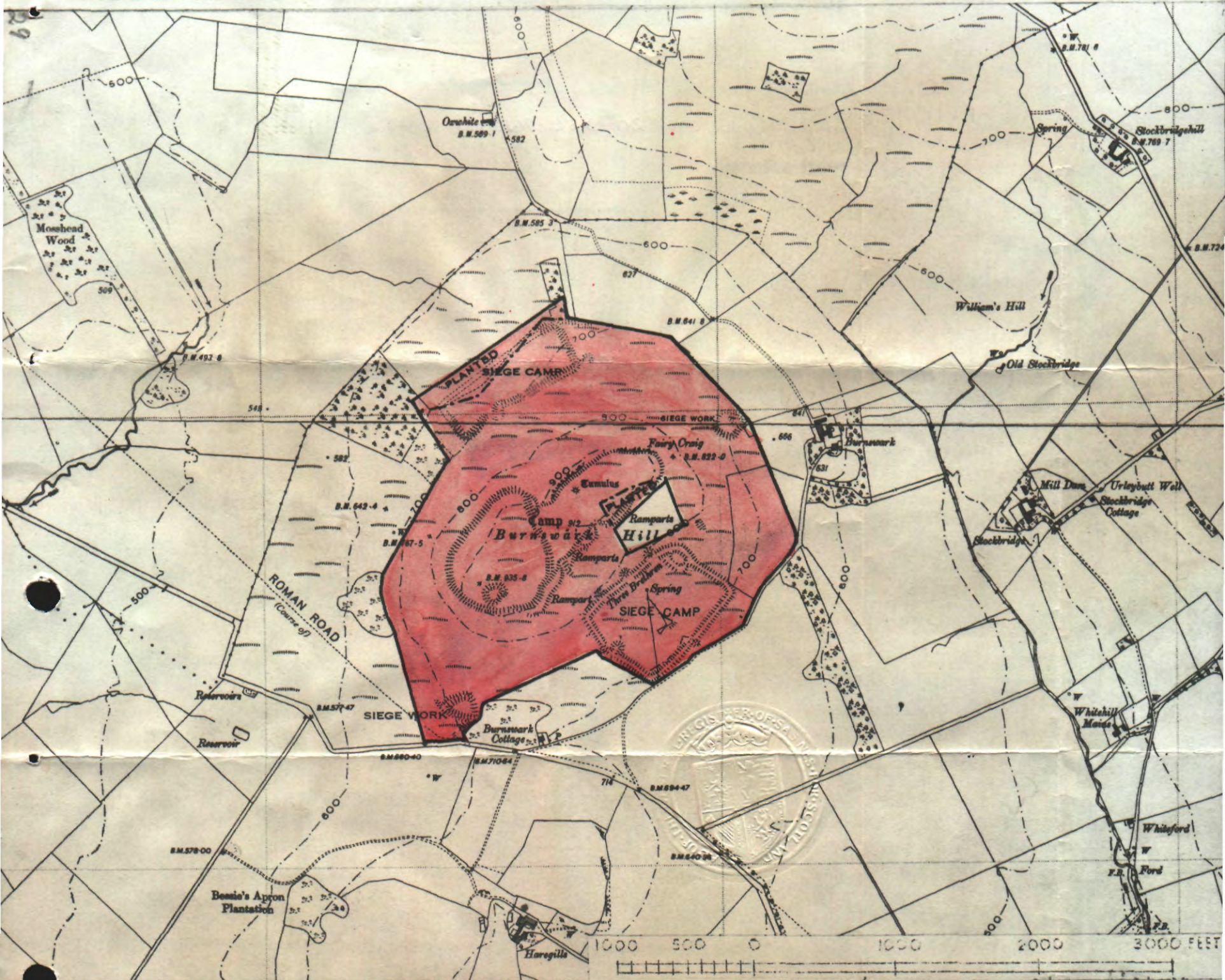
BURNSWARK (BIRRENSWARK HILL) FORT, ROMAN CAMPS AND EARTHWORKS.