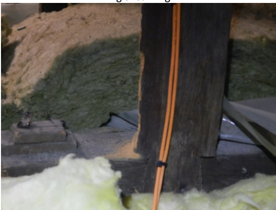
Fig 7: strut