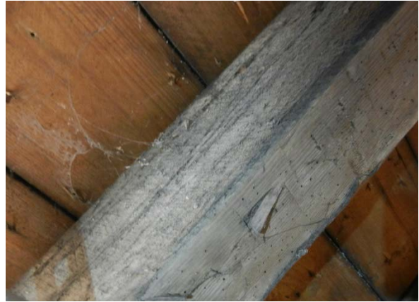
Fig 10: common rafter