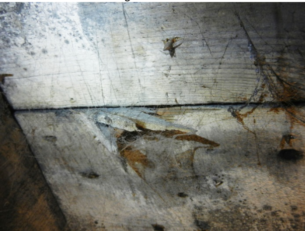
Fig 18: sarking