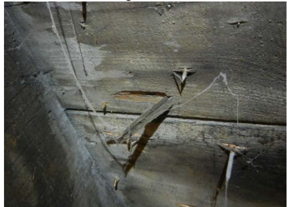
Fig 6: sarking