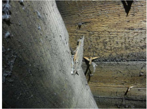
Fig 15: rafter