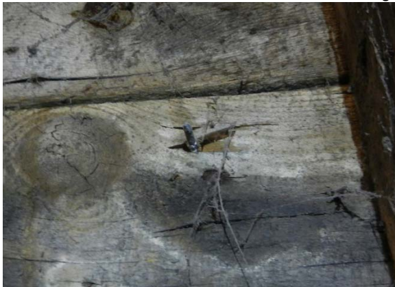
Fig 12: sarking