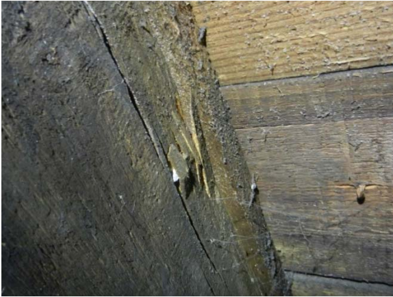
Fig 14: rafter