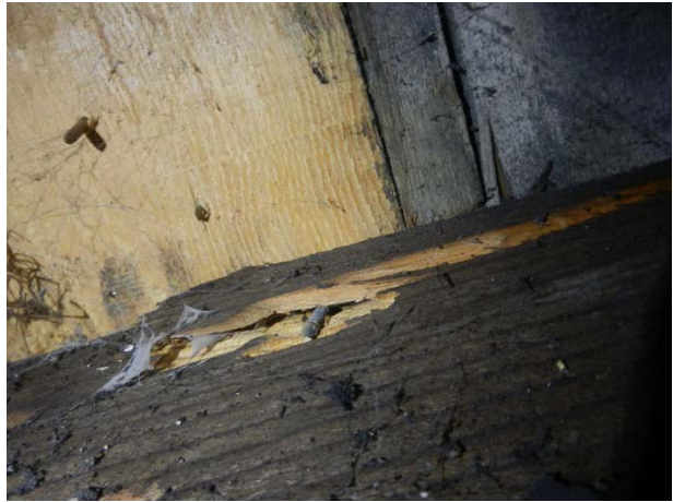
Fig 17: rafter