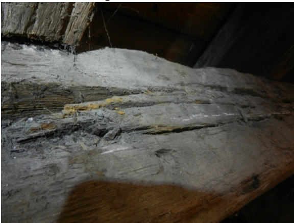
Fig 11: purlin