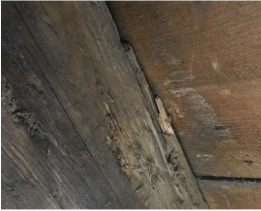
Fig 1: rafter