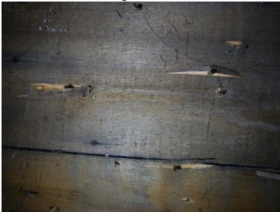
Fig 5: sarking