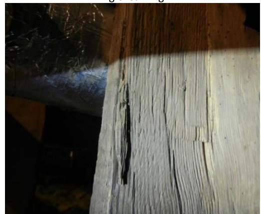
Fig 8: strut