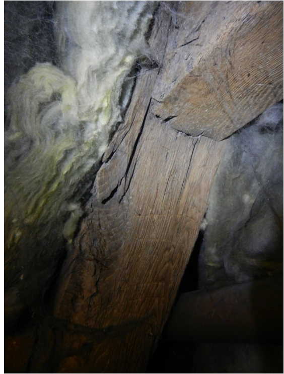
Fig 21: rafter