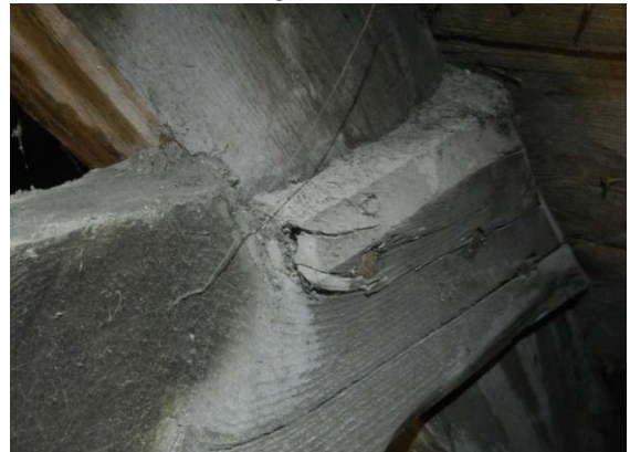
Fig 4: collar