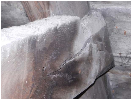
Fig 3: collar