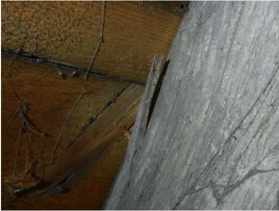
Fig 9: common rafter