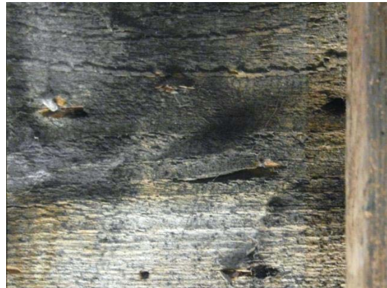
Fig 13: sarking