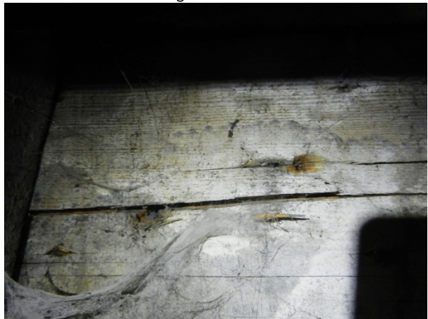
Fig 19: sarking