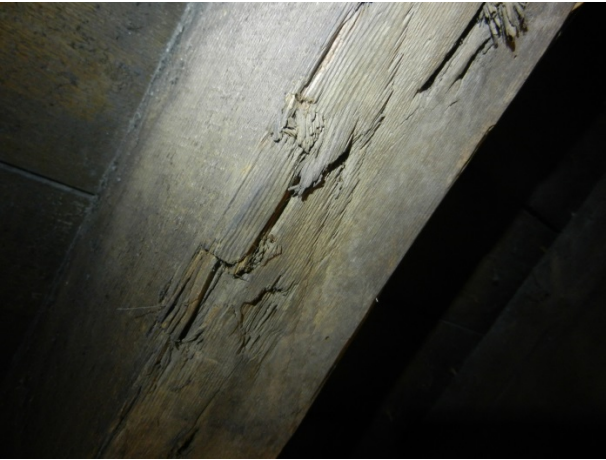
Fig 16: rafter