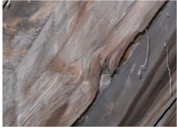
Fig 2: rafter