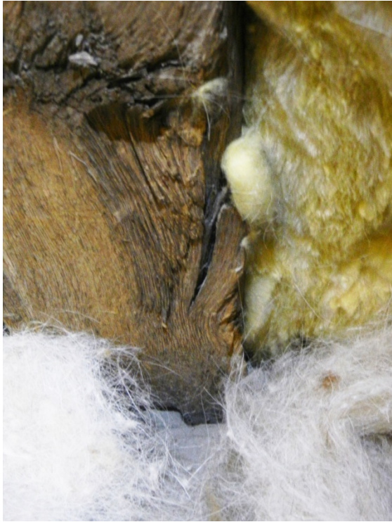
Fig 20: rafter