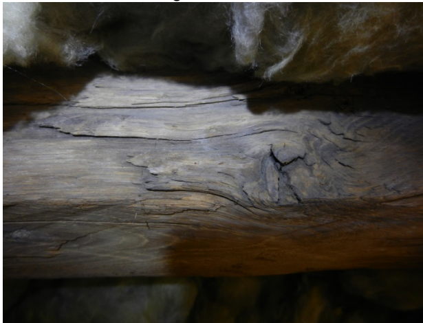
Fig 22: upper collar