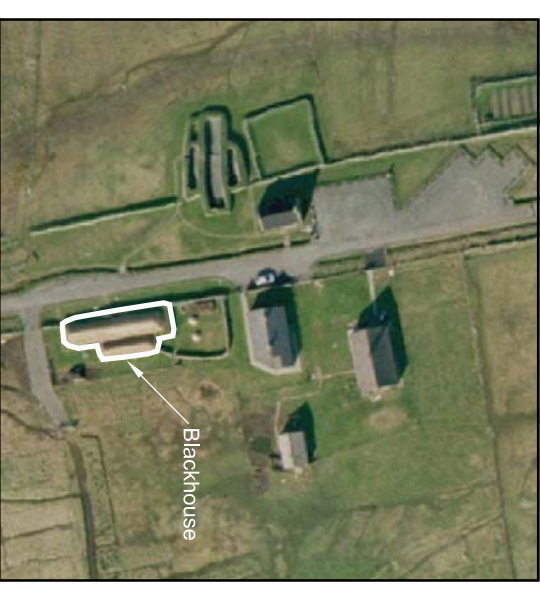
Blackhouse complex plan