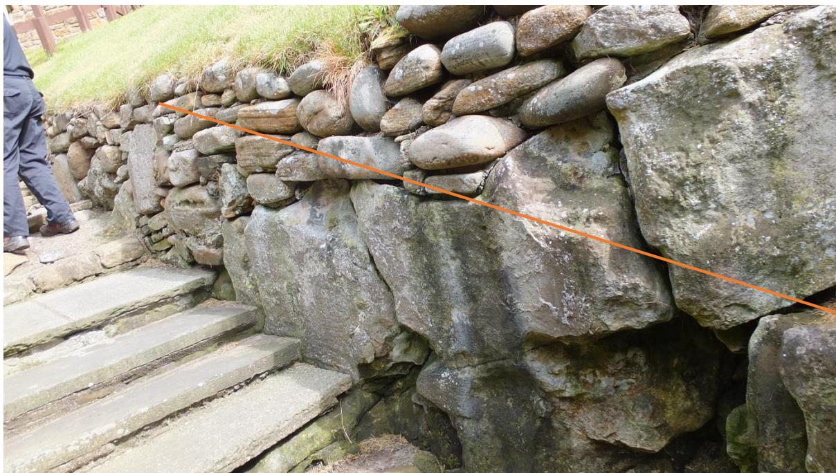
Modern rubble build to be locally rebuilt with cement mortar core where fixing required. Rope handrail.