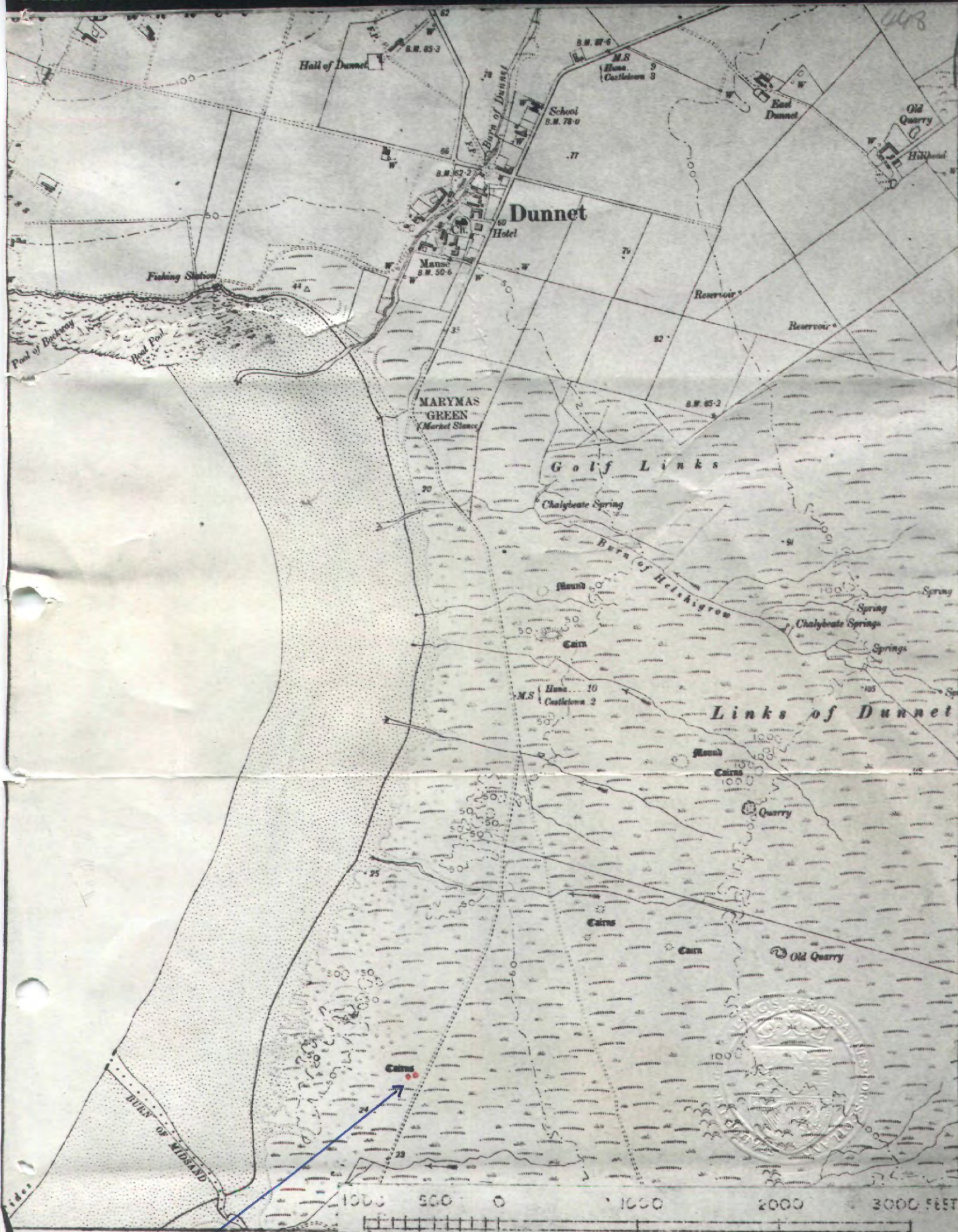
37 TWO CAIRNS, West side of DUNNET - CASTLETCH RD. CROWN COPYRIGHT RESERVED. MINISTRY OF WORKS, 1960.